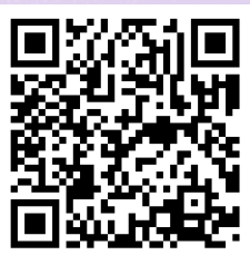
Tickets for Peace Proms